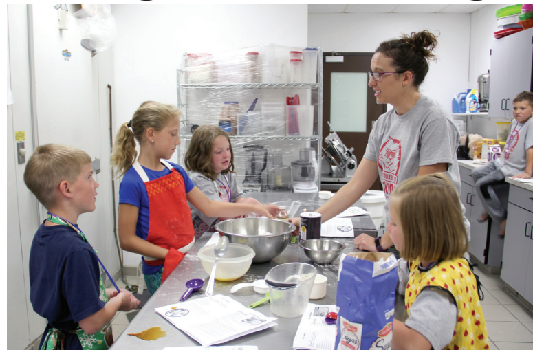
Who would want to go back to school in the middle of summer? About 150 Lake Region youngsters did, attending College for Kids at Lake Region State College the week of July 17.

About 150 children in grades 1 through 6 participated in College for Kids, a fun, enriching program which challenges kids to use their imaginations, ask questions, think creatively, experiment, meet new friends and experience a taste of college.